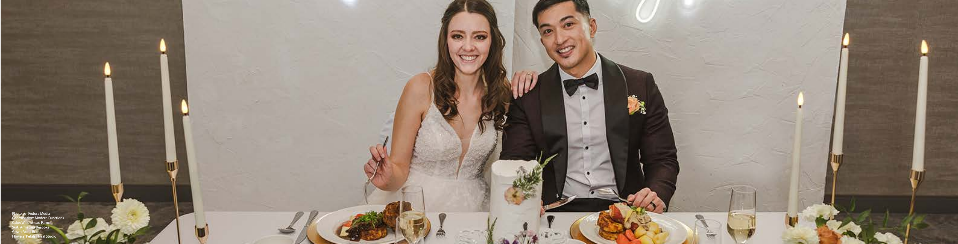
Coordination: Modern Functions Cake: Willowhead Farm Suit: Armature Bespoke Gown: Vona Bride Flowers: Petals Floral Studio